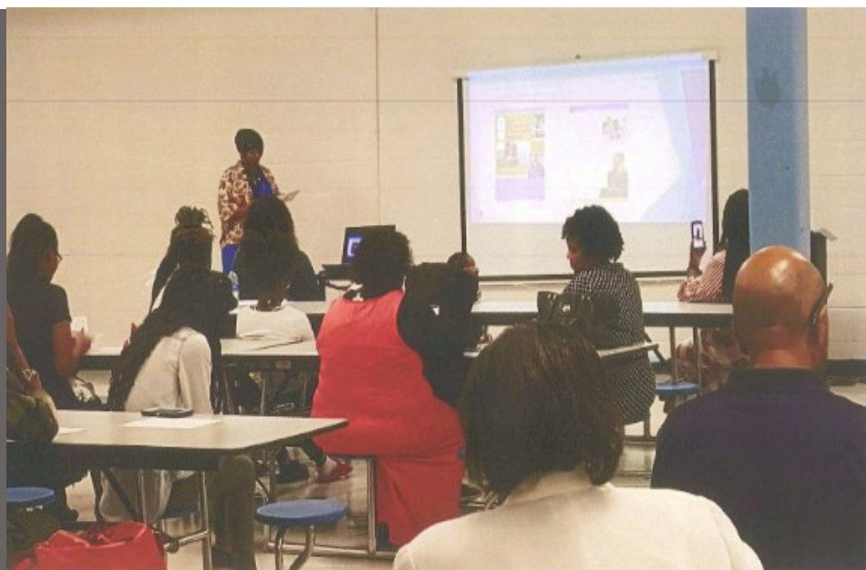
Parents receiving valuable information at a school's parent night

Additionally, the Title I department will provide training to principals during the 2018-2019 district summer leadership team summit and will post a webinar so principals will understand parent and family engagement requirements and plan opportunities for family engagement activities and meetings for the remainder of the school year.